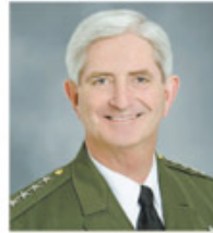
Bill Gore, 67 San Diego County sheriff $241,000