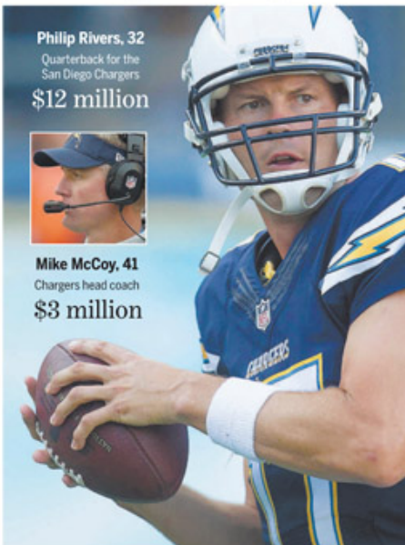
Philip Rivers, 32 Quarterback for the San Diego Chargers $12 million