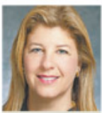
Cathy Ann Bencivengo, 55 U.S. district judge $199,100